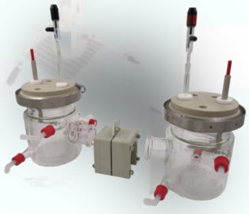
Fig 2: Devanathan cell with tensile testing device